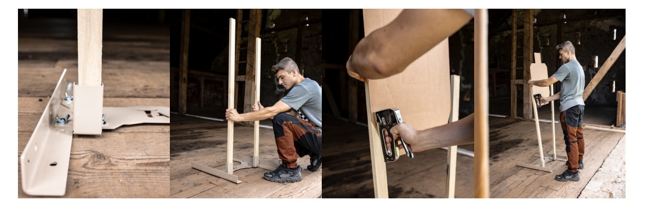
At this point your base and cardboard are ready to shoot. Please download and read our safe shooting rules prior to engaging in ANY shooting activity. ALWAYS WEAR APPROVED EYE AND EAR PROTECTION WHEN YOU ARE SHOOTING A FIREARM.

Note: The cardboard target base and its components are NOT targets. They also are not to be used with steel target systems. Do NOT shoot bullets at your cardboard target base under any circumstances. Damage WILL occur and this can be dangerous.